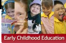
Early Childhood Education